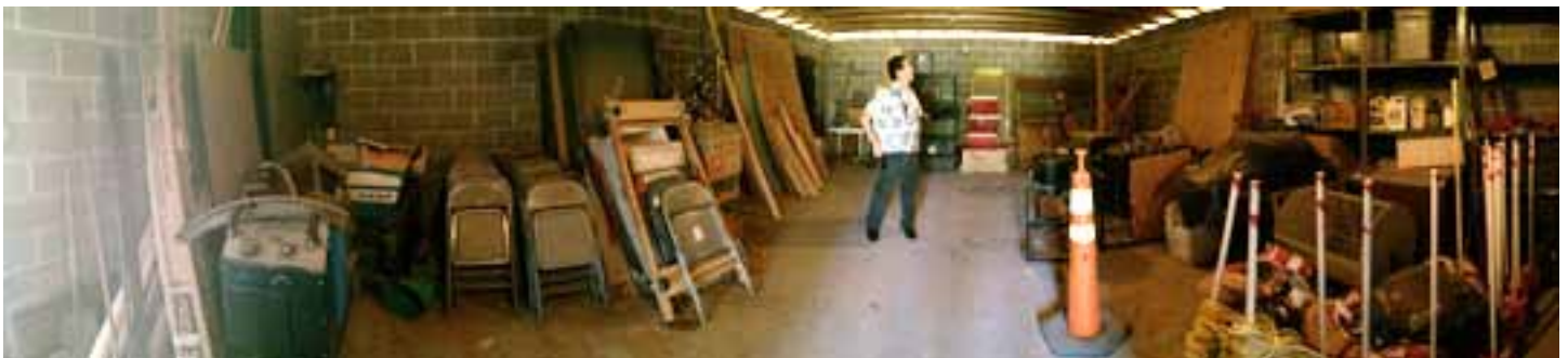
The blockhouse. I think there is a bat in here.