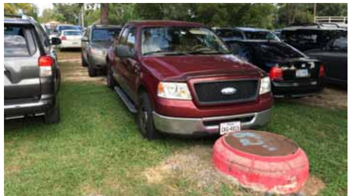
This image requires no explanation

Next month is our Council 6557 Memorial Mass. It is on Thanksgiving Day November 27 at Sts Simon and Jude. Please come in your Sunday 'go to meetin' clothes, this is not a 4th degree turnout day, but our special time to give thanks to all those who came before us and did so much for our council and community. Bring the whole family, cousins, friends, neighbors, and business associates. We should be very thankful. We have a busy council, a busy council is a gift in itself.