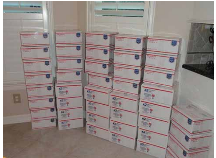
What is in all these boxes going to Veterans for Christmas?