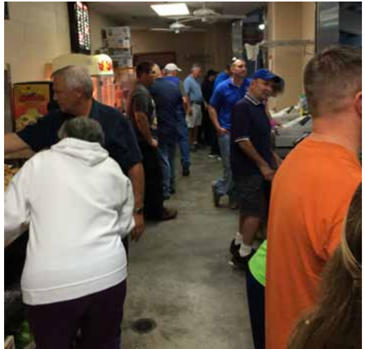
Friday Knight Lights