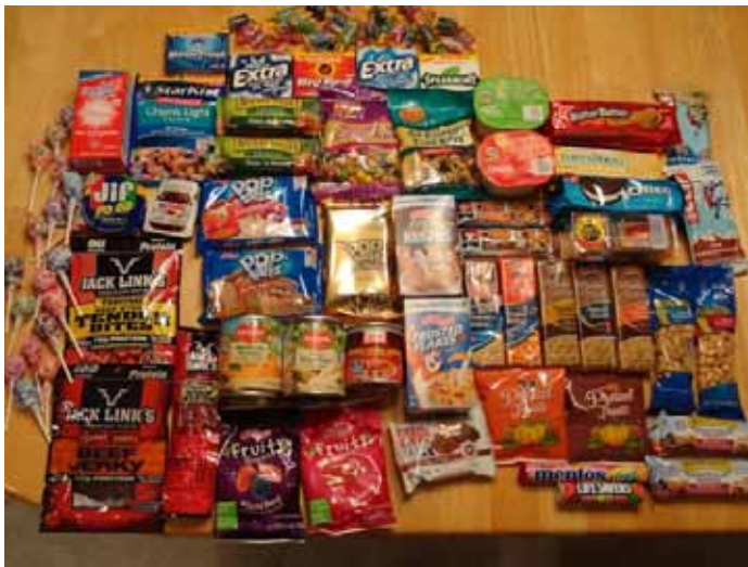
Vet Supplies! Goodies that would make a grizzled old gunny smile.