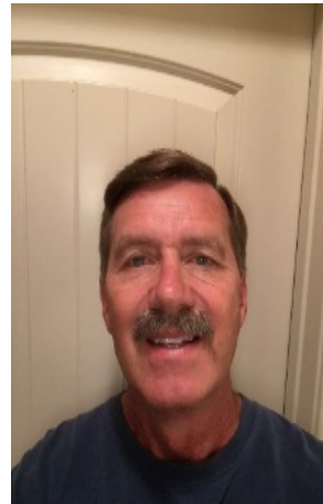
Grand Knight Council 8306

God bless, and I hope to see you at the April 13 th meeting